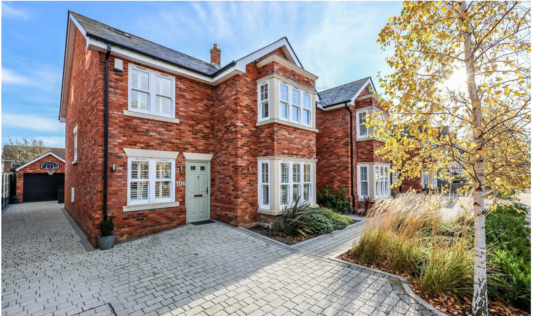
Salisbury Road, Leigh-On-Sea £1,000,000